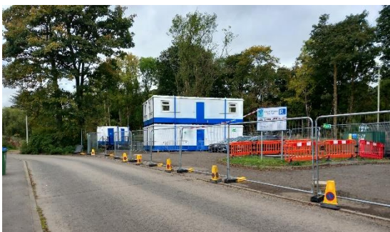
Figure 1: Field of Refuge compound

A satellite site compound has been formed at the Field of Refuge car park meaning public parking will not be available for the full duration of the flood scheme construction.